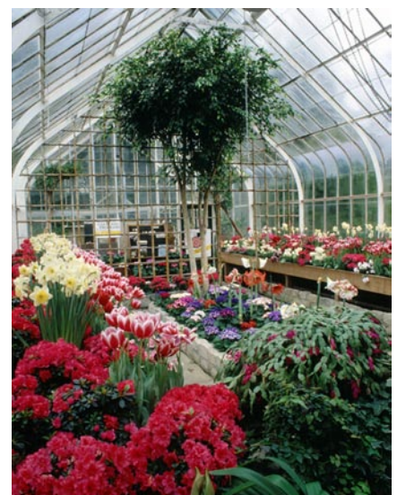
The Vaisala HUMICAP® Humidity and Temperature Transmitter Series HMT100 measure relative humidity or dewpoint, and temperature accurately in humid and wet environments.

The accuracy of the instrument can also be checked using the Vaisala Humidity Calibrator HMK15, which is based on saturated salt solutions.