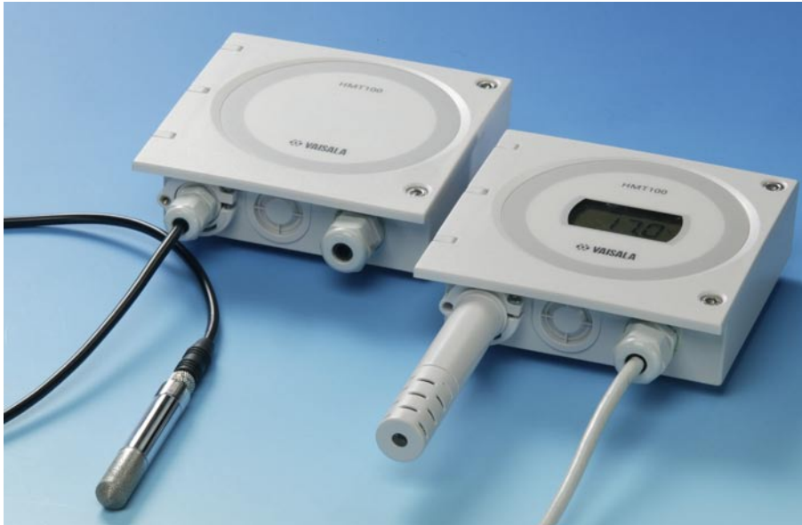
HMT100 remote probe and wall mount models.

The Vaisala HUMICAP® Humidity and Temperature Transmitter Series HMT100 are designed for humidity and temperature monitoring in demanding environments.